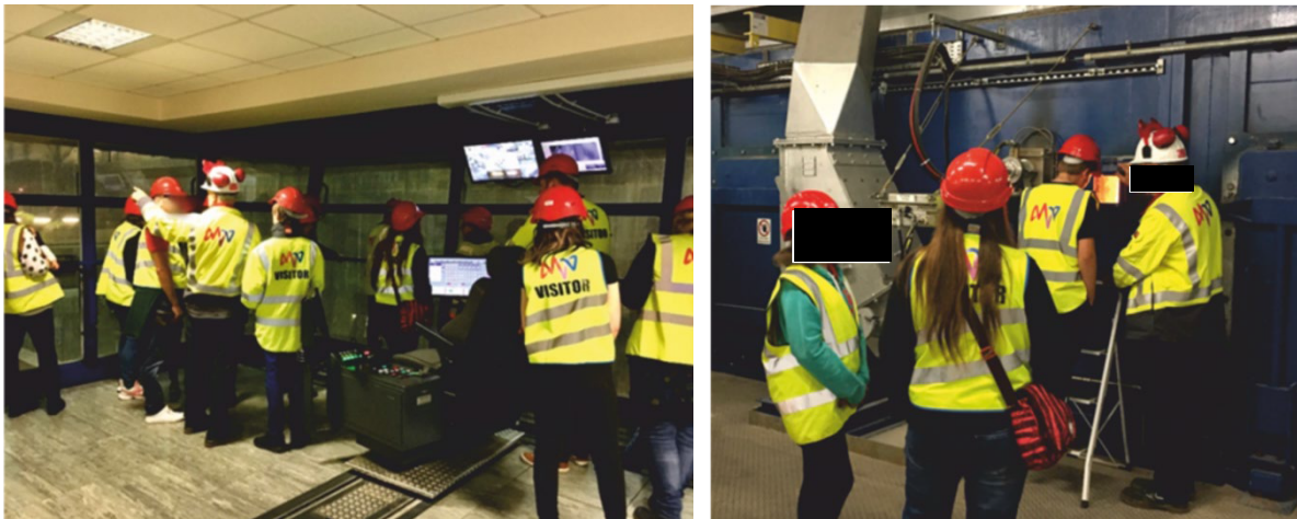
Graphic 2.2: Photographs of a typical site tour at MVV's Plymouth facility control room (left) and boiler house (right)