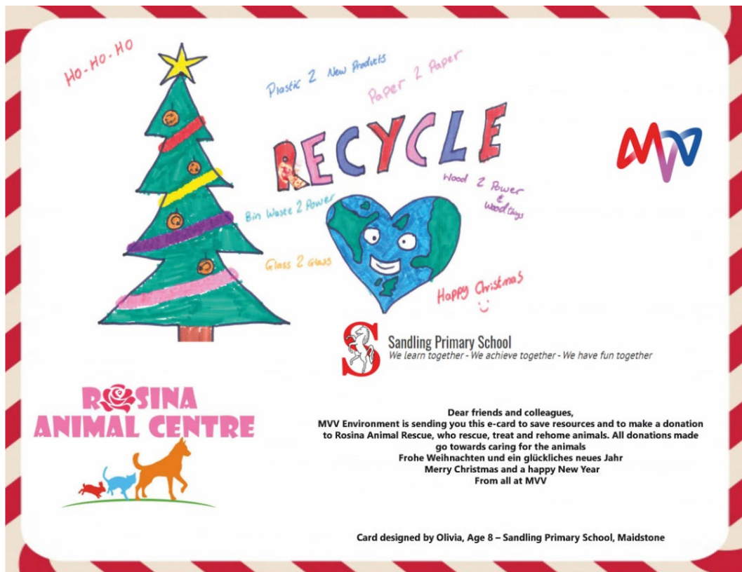
Graphic 2.4: Winning Christmas Card 2021